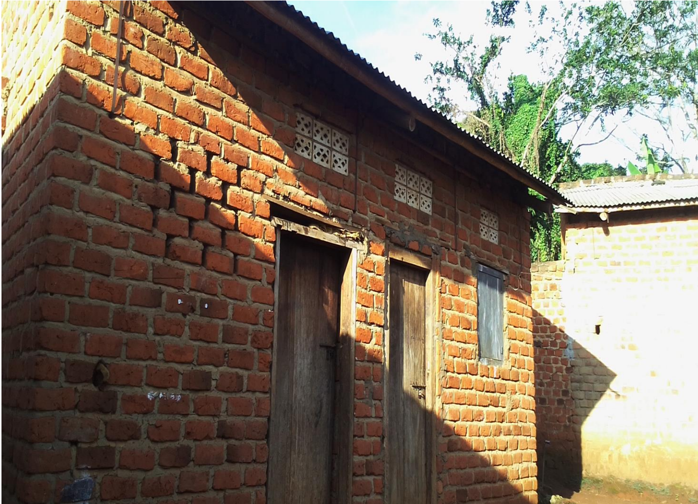
2 single units