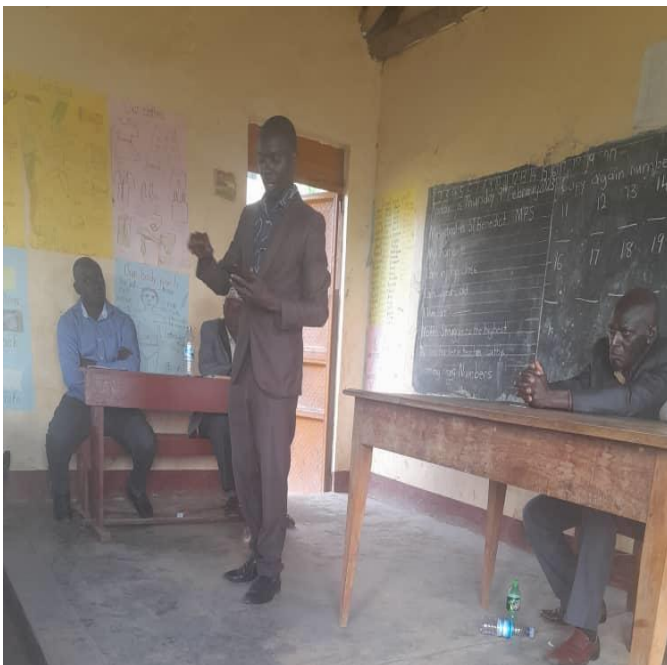
Photo showing the KAP Program coordinator (on behalf of KAP management) during the school meeting