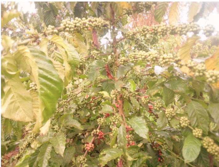
Photo showing a coffee plant at the KAP model farm

KAP is in preparation to plant more coffee at the model farm at the beginning of the first rainy season in March 2023. According to KAP management the income from coffee will be used further to finance KAP administration costs. It should be noted that this is a seasonal project.