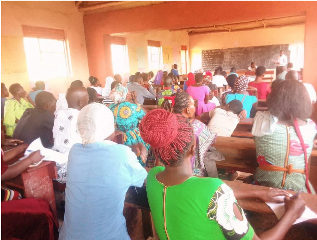
Photo showing parents and teachers during the school meeting

The school management together with KAP management started the process of mobilizing the local contribution (25%) so that the school can have the dormitories constructed.