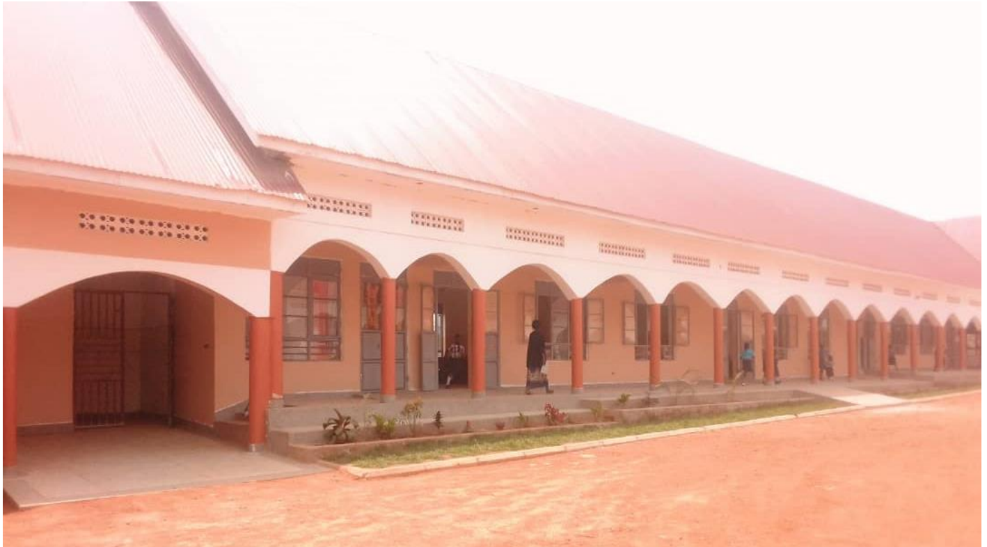
Photos showing Zinunula international school progress

The community members have shown interest in the school because of the daily increasing number of pupils that join the school.