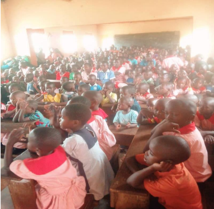
Photo showing pupils at St Benedict during mass in the main hall

Because of the support the school received from German through Kyamulibwa Anti - Aids Program (KAP), the school's learning and teaching environment is now conducive, a factor that has attracted a big number of parents and guardians to bring their children to the school, since the completion of the renovation and construction of new buildings, compound construction and a water harvest system installation, the number of pupils at the school has been increased year after year, for example in 2020 the number of pupils was 270, in 2021: 320pupils, 2022: 360 and in 2023 the number is 400.