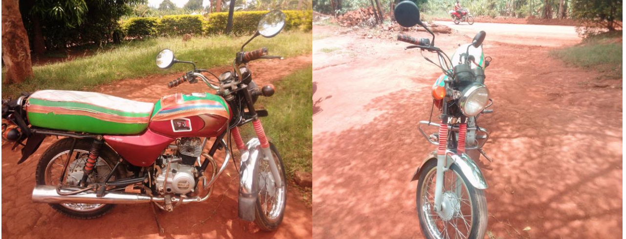
Photos showing KAP Boda boda

Currently the Money from the project has reduced because the boda has become old. KAP management is in preparation to replace it with the new boda.