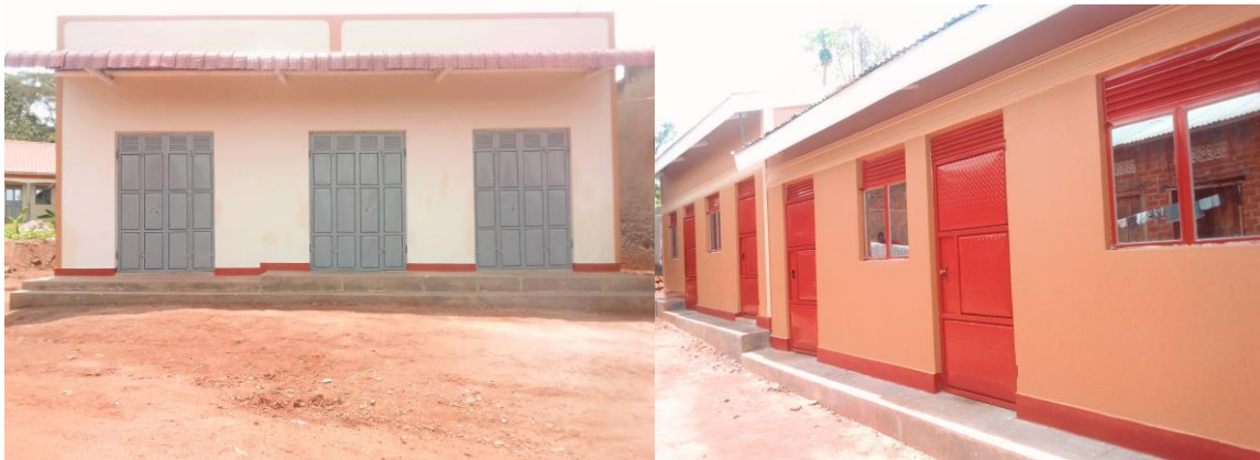
Photos showing single and double rooms, renovated in the first phase

The project is performing well. All the finished rooms during phase 1 were occupied by the tenants. This project has strengthened the KAP financial status, now there is still a great demand for residential and commercial rentals in the area due to a big population of Kyamulibwa Town.