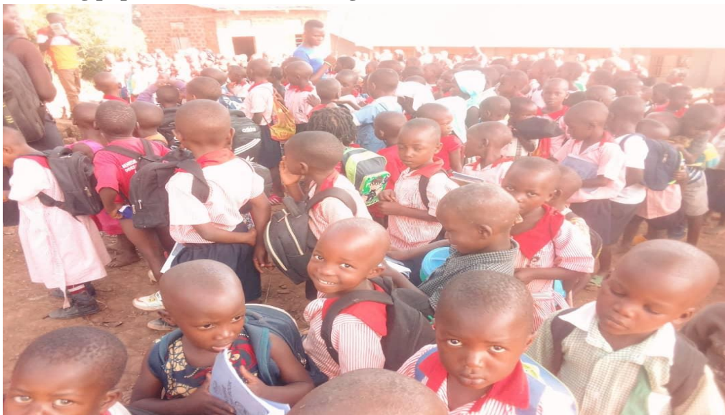
Photos showing pupils at the School Parade